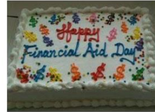
Financial Aid Appreciation Day October 17 th , 2014